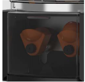
Smoky grey front cover

The Auto Cleaning System improves the juicer's efficiency due to the automatic cleaning filter. The new filter has a belt made of polyurethane that moves, thanks to a motor axle, when the squeezer is running. The belt cleans the filter by sweeping the pulp and the seeds resulting from juicing the fruits, which are then collected in the peel collection bins.