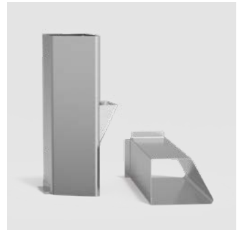
Adaptable chutes for counters