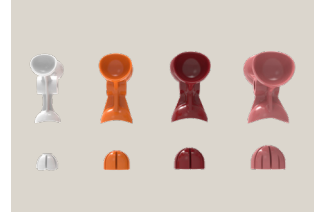
Juice extraction kits

Medium (M): Orange; Optional Large (L): Maroon; Extra large (XL): Pink; Small (S): Grey.