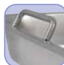
Patented handle system