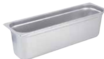
SPJH/SPJL-SERIES HALF LONG STEAM PANS