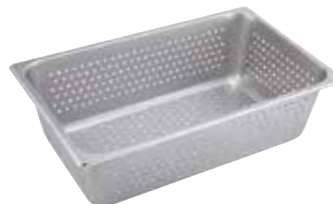
SPJH/SPFP-SERIES PERFORATED STEAM PANS