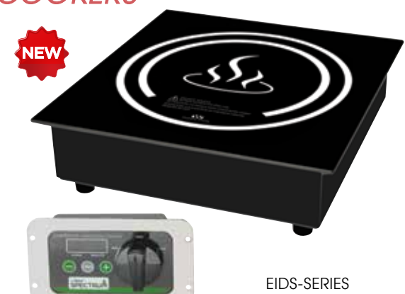
Control panel mounts to front of counter where drop-in cooker is installed