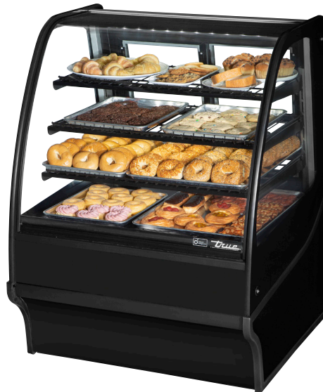
TDM-DC-36-GE/GE-B-B (optional black interior)