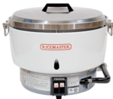
GAS AND ELECTRIC RICE COOKERS AND WARMERS