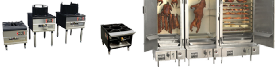
WOK RANGES AND SMOKERS

Other products from the company with over 83 years of Chinese food service experience. Visit us on the web at www.townfood.com