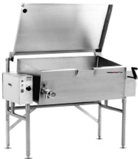
Model TT-TTMTSK-E40 (with optional 1.5" draw-off valve & adjustable flanged feet)