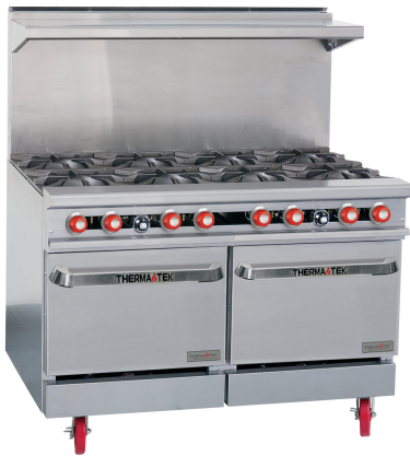
TMD48-8-2 (Optional casters shown)

NOTE: Ranges supplied with casters must be installed with an approved restraining device.