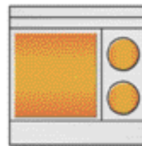
TRE36C5/D5 • One 12" x 24" x 1/2" griddle plate • Two round hotplates