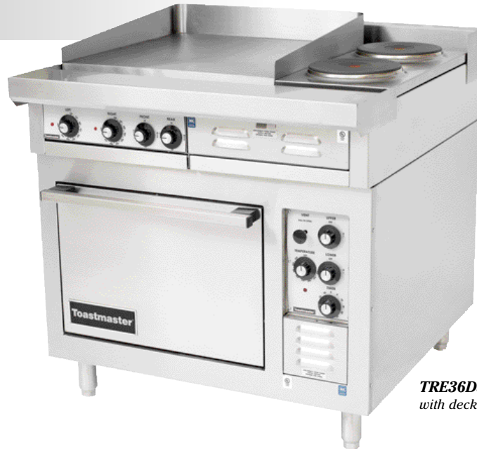
TRE36D5 with deck oven base