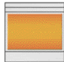
TRE36C3/D3 • One 36" x 24" x 1/2" griddle plate