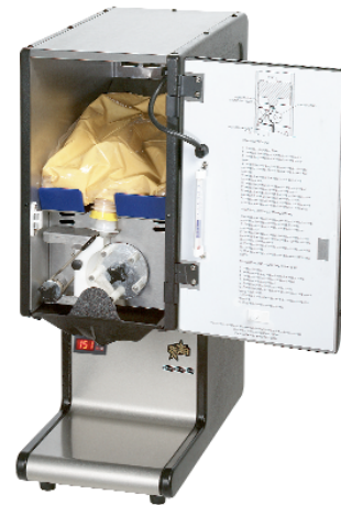
Model HPDE1 (cheese not included)