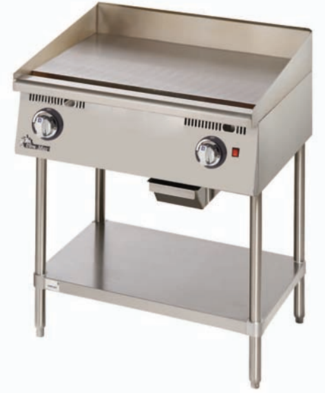
Model 824TSCHSA (stand optional)