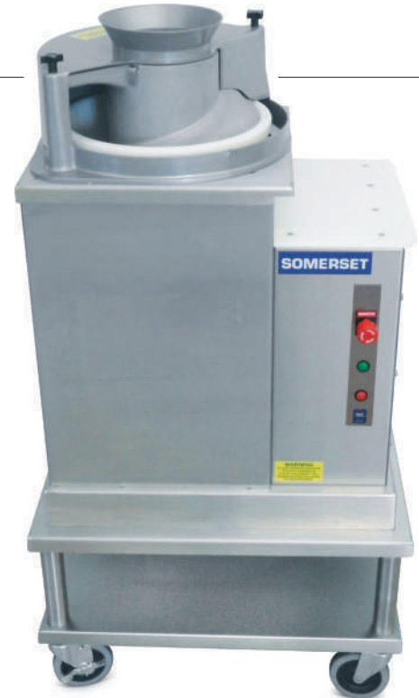
Rounder with Table SDR-400T