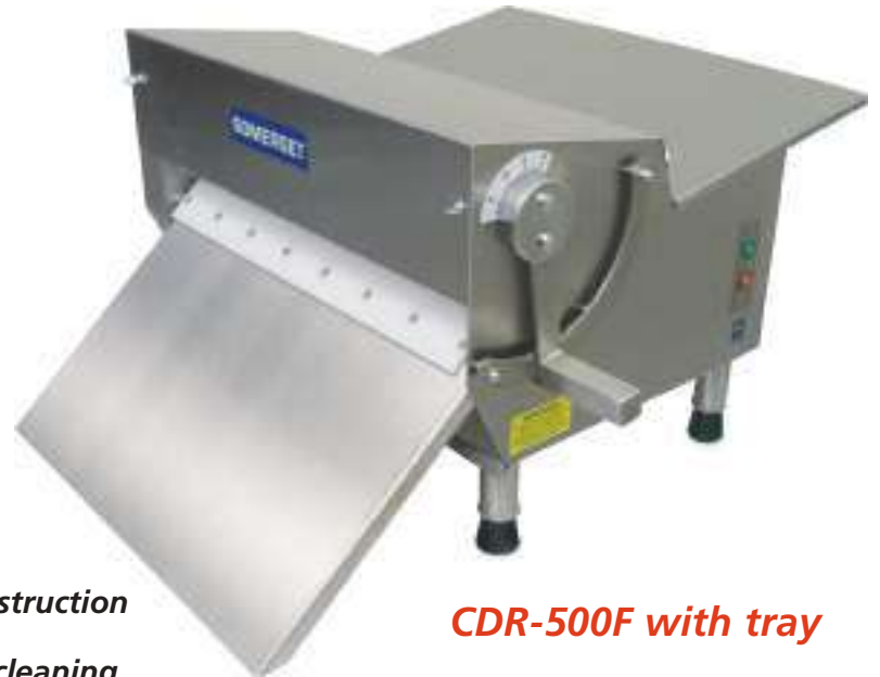
CDR-500F with tray