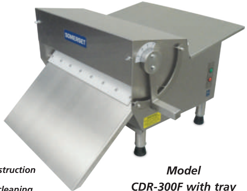
Model CDR-300F with tray