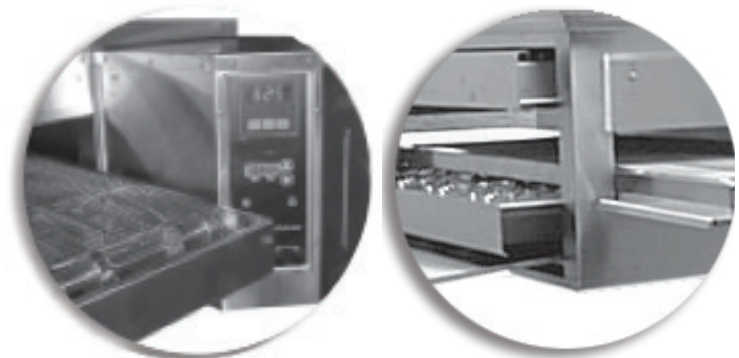
Removable panels for easy cleaning