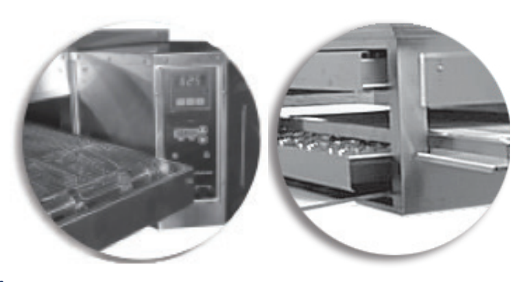
Removable panels for easy cleaning