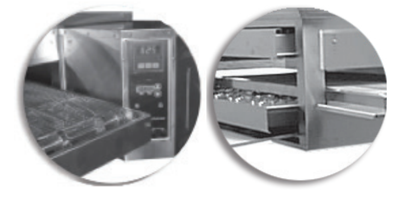
Removable panels for easy cleaning