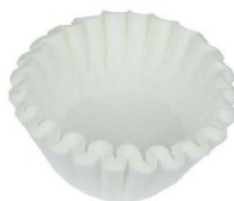
(25) Filter Paper included