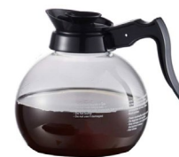
(3) Glass Coffee Decanter included