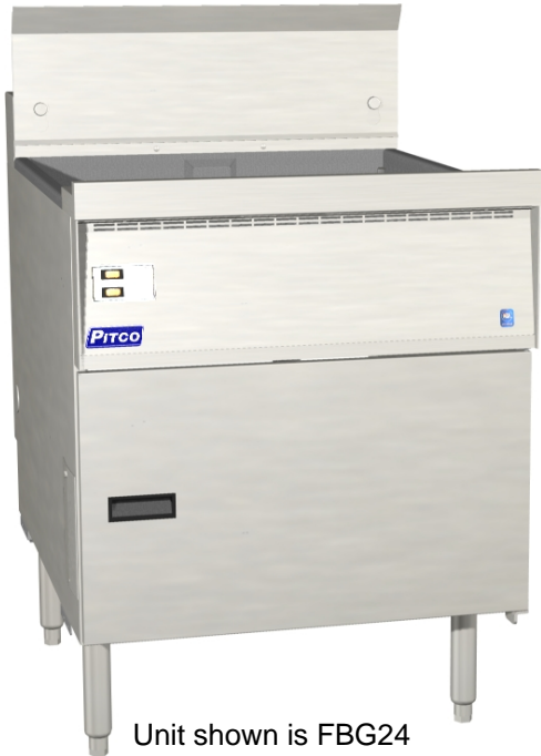
Unit shown is FBG24

Model FBG18 and FBG24 Flat Bottom Gas Fryers