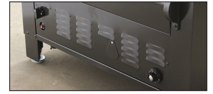
Easy access front controls