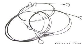
Cheese Cutter Wires