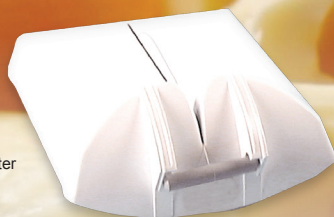
Plastic Cheese Cutter

The floating wire design allows for a smooth action with all types of cheese. Available in plastic or stainless steel, all models offer dependability and ease of cleaning.