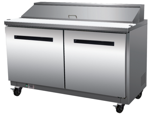
Model MXCR48S Model MXCR60S