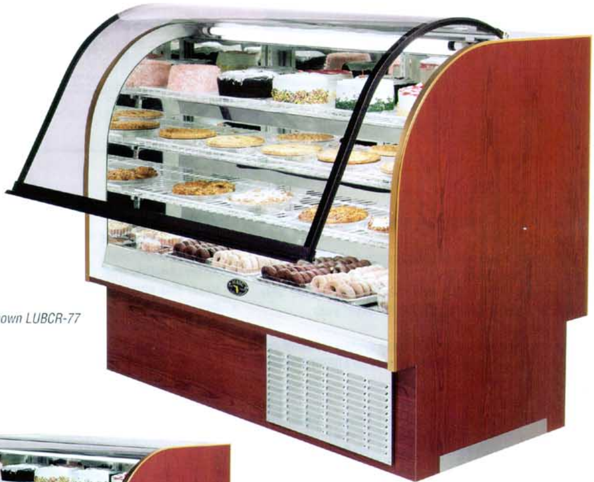
model shown LUBCR-77