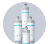
Arctic Pure Water Filters