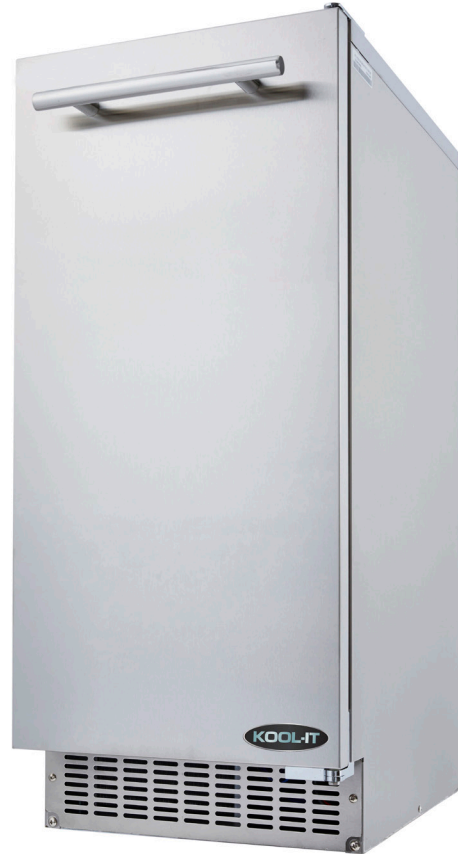
Bell/Gourmet Cube Dimensions