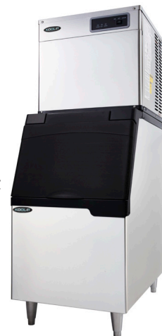
Bin KB-260-22 shown above is not included - sold separately