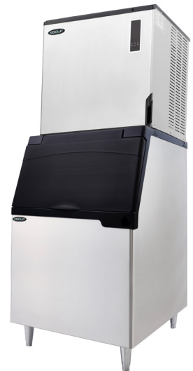
Bin KB-440 shown above is not included - sold separately