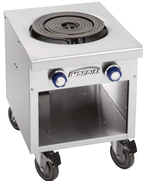
ISPA-18-E shown with optional casters