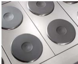
9" (229 mm) sealed round plate elements with easy to clean flat surface.

IR-10-E IR-10-E-XB IR-10-E-CC IR-6-G24T-E IR-4-G36T-E