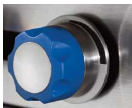
Durable cast aluminum with a Valox™ heat protection grip.