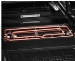
5 KW element provides even heating throughout the oven cavity.