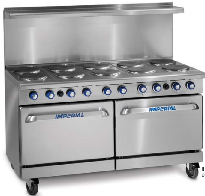
IR-10-E shown with optional casters