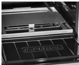
Splatter screen protects the element from spills.