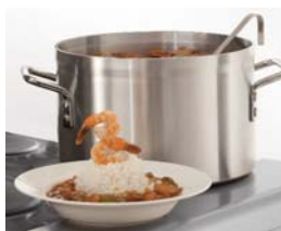
Large 5" (127 mm) stainless steel landing ledge for convenient plating.