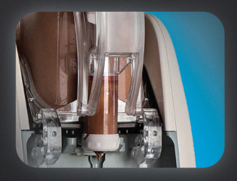
Patented nozzle: Guarantees fast and clean dispensing.

User-Friendly Electronic Touch Pad: With patented dispensing system, QK1 provides portion controlled servings of approximately 2.5 oz. each.