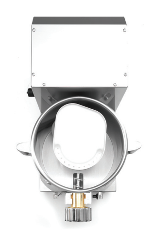
A: Exit Closure (While Mixing)