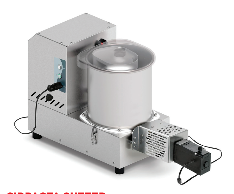
SIRPASTA CUTTER VARIABLE-SPEED PASTA CUTTER (SOLD SEPARATELY)