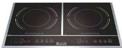
Shared power - will not reach maximum power (1800W) on both sides.