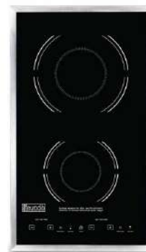
2800W (front: 1000W, back: 1800W)