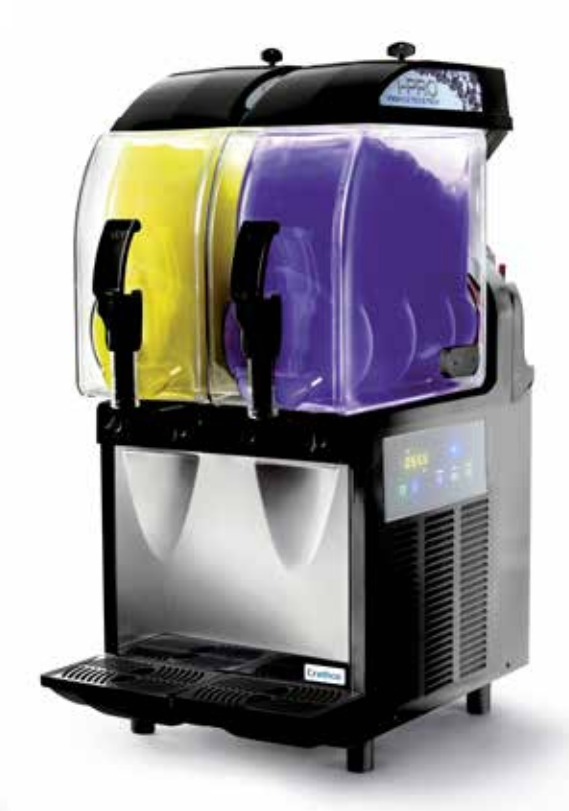
Model I-PRO 2E