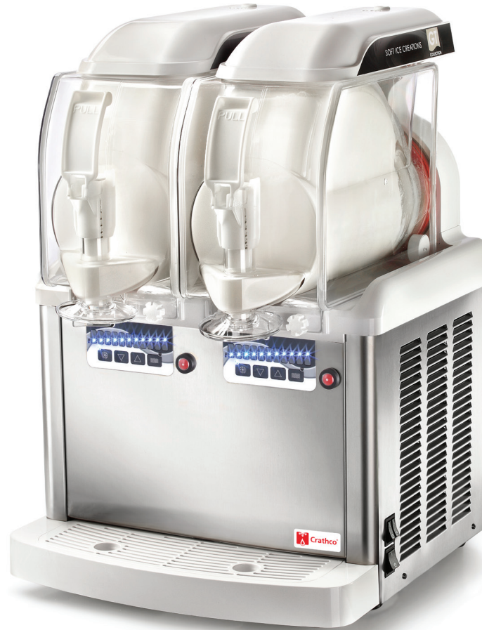
model GT Push 2