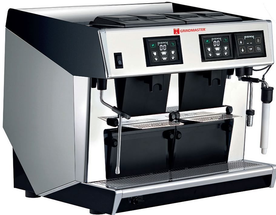
model Pony 4