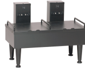
2SH STAND, 120V BLK