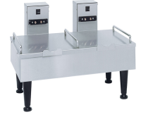
2SH STAND, 120V