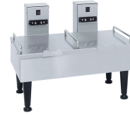
2SH STAND, CE 220V 60HZ INMETRO