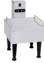
1SH STAND, CE 220V 60 HZ INMETRO