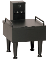
1SH STAND, 120V BLK