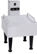
1SH STAND, CE 220-240V W/UK PLUG