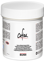
CLEANING TABLETS, CAFIZA 100T