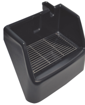
TRAY ASSY, EXTENDED DRIP