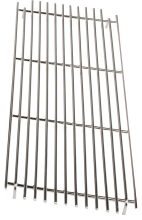
WIRE GRILL, DRIP TRAY (SINGLE)