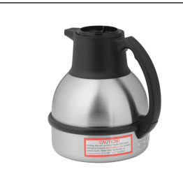
THERMAL CARAFE, BLK 1.9L 12PK