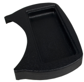
DRIP TRAY, TDO/TCD