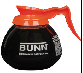
DECANTER, GLASS- ORN 12 CUP 1PK