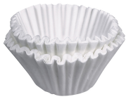
FILTERS,REGULAR1M 500/2 50/CL Product #: 20115.0000