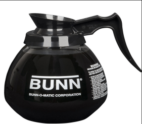
DECANTER, GLASS-BLK 12C 3/CS