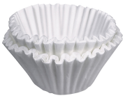
PAPEL FILTRANTE Product #: 20115.0000