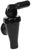
FAUCET ASSY, BLACK NUDGER