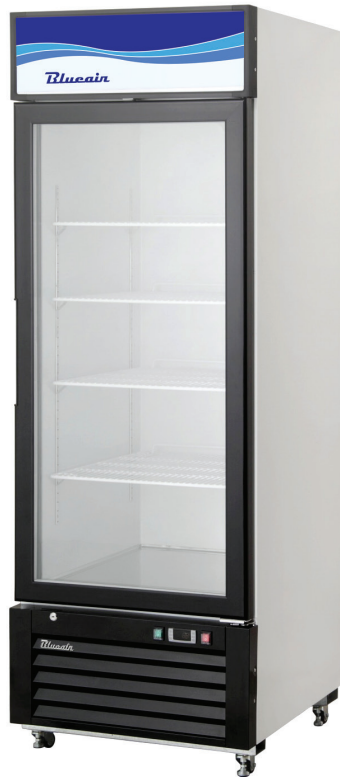
BKGM12-HC / BKGM14-HC