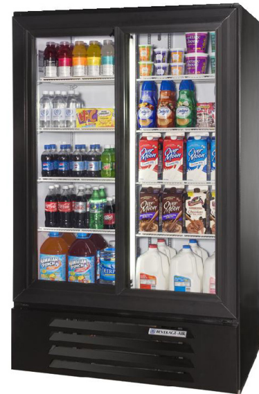
LV15-1-B (shown with optional fourth shelf)