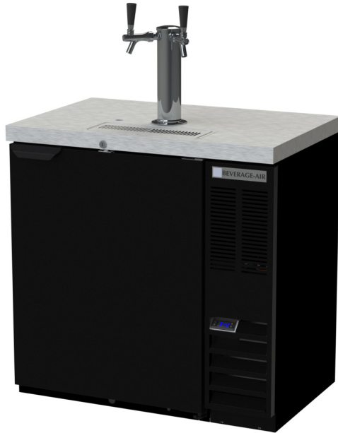
(black model shown)

3 Year Parts/Labor Warranty Additional 4 Year Compressor Warranty