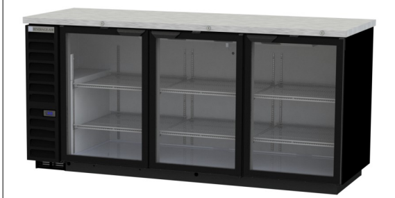
BB78HC-1-FG-B (Black model shown)