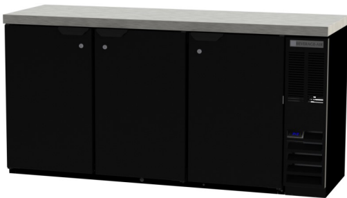
BB72HC-1-F-B-27 (Black model shown)