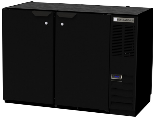
BB48HC-1-B-PT (Black model shown)