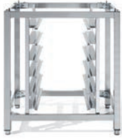
AX-C6ST OVEN STAND