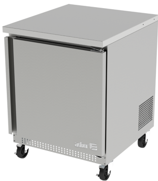
AUTR-27 / AUTF-27 HC